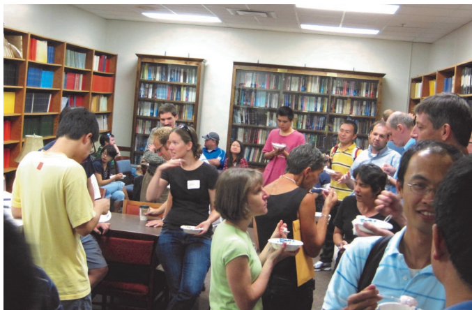
Graduate Students, Faculty, and Staff mingle at the Ice Cream Social at the beginning of the Fall Semester.

We also planned a hiking event during the spring semester. But due to the unexpected chilly weather, we haven't made it happen. As the weather gets warmer, we are planning on a trip soon.