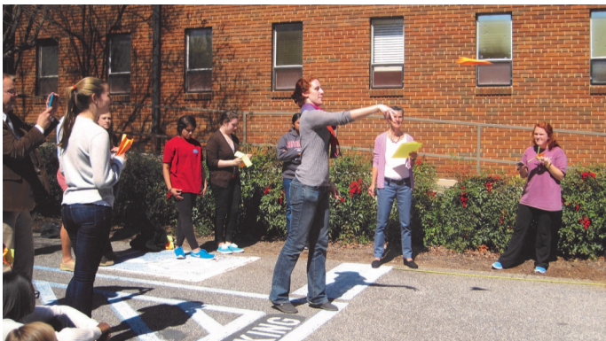
Students take turns flying the airplanes which they constructed

One popular investigation is an experimental design activity - constructing and flying two different types of paper airplanes.