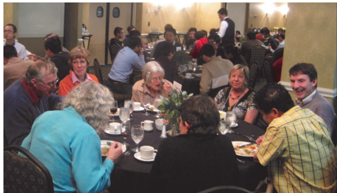
The conference offered not just food for thought