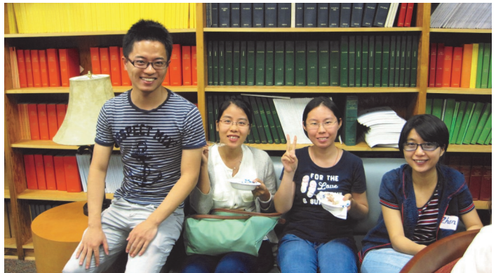
Graduate students enjoy ice cream at the Welcome Party in the Fall.